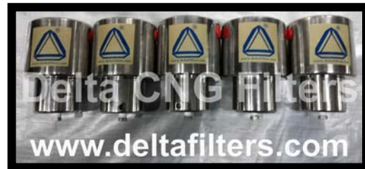
CNG-050: 1/2" NB, 500 SCM H * @ 250 Bar * SCM H : Std. Cubic Metre/Hour

Delta CNG Filters offer both particulate removal and liquid separation in a single filter housing. Pleated borosilicate glassfibre based filter elements offer the best performance in the industry. The process of pleating introduces 5 times the surface area for filtration as compared to traditional filter elements. The end result is large surface area, long life of filter elements, lowest pressure drop and long Mean Time Between Maintenance (MTBM).