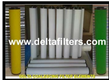
DELTA Pleated GlassFibre Cartridges